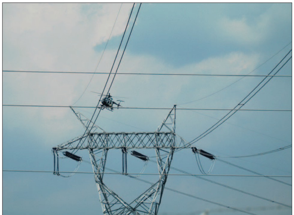
A helicopter, equipped with a LiDAR scanning laser, measures precise line clearances from vegetation.

mission lines alone, ground crews clear roughly one-fifth of the transmission system's approximately 18,000 km of wire from 69 kV to 500 kV (around 3500 km) each year. Most challenging is the mountainous ter-