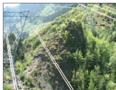
The sag variance and closeness to the ground on the “up-hill” spans require vegetation removal on two-year cycles.

“ The accurate and detailed information and mapping can assist in better planning and more accurate depiction for vegetation control. ”