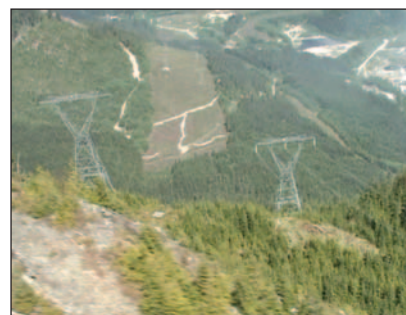
Monitoring vegetation growth is a challenge on 500-kV lines, which traverse over steep granite outcroppings and long vertical drops.

The PLS-CADD design software, developed by Power Line Systems, features conductor-to-vegetation clearance analysis using LiDAR-supplied vegetation points. PLS-CADD already had the ability to establish conductor positions under a variety of ice, wind and temperature conditions. In addition, it had the ability to perform clearance analyses to an assortment of categories of survey points each with unique conductor clearance requirements. Vegetation management professionals worked with Power Line Systems to develop a method to identify vegetation points that violated designer-prescribed horizontal and vertical clearance-to-conductor values as well as a method to identify trees that would come within a designer-prescribed clearance value if the tree fell. The capabilities were achieved by assigning horizontal and vertical clearance values for each type of survey point—roads, ground and vegetation. Safe clearance calculations were established based on the required electrical clearance, an allowance for vegetation growth and an additional safety margin. The modeling program could then identify “grow-in violations”—vegetation points that encroached this zone of safety.